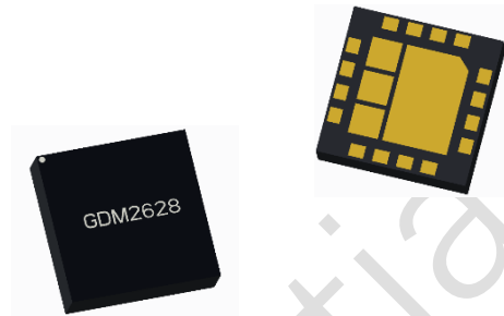
Figure 1. 16 Pad 5 x 5 mm Laminate Package